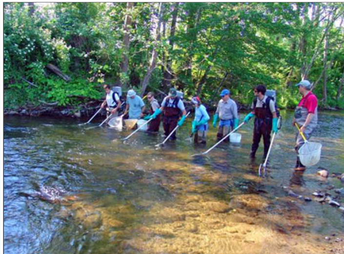
Fish Survey on Thornton River.