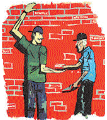
Building a New Community by Delvia Cortez

We may be one of the poorest parts of the country, but we're rich in stories.